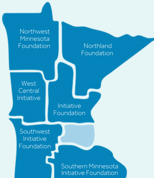
Minnesota Initiative Foundations